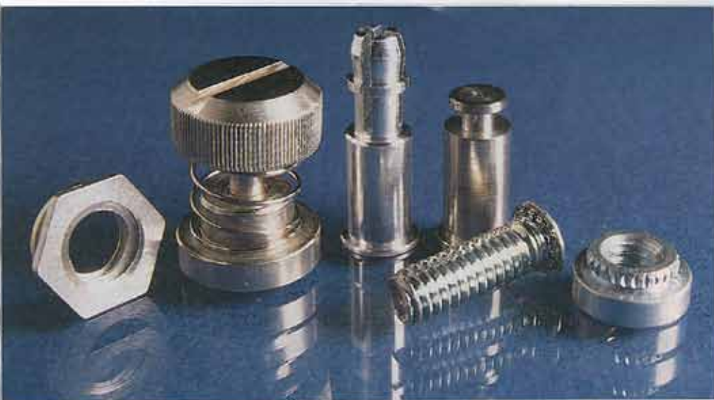
FIGURE 1 Over the years engineers have developed myriad types and variations of self-clinching fasteners.

similar metals and permits the entire assembly to be anodized or given a conversion coating.