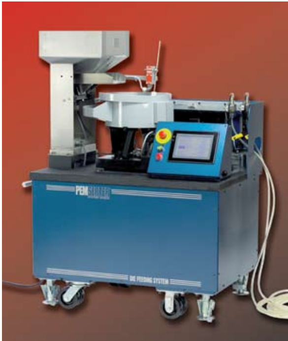
PEMSERTER In-Die System