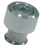
All Metal Type PF11PM