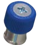
Plastic Knob Type PF11PM (blue)

Consult PEM bulletin PF for specifications. The most current version of this bulletin can be found on our website.