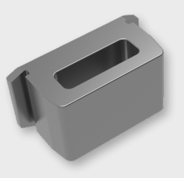
Cable-Tie Mounts and Hooks