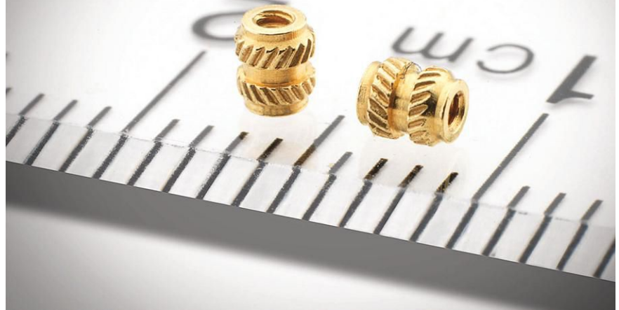
Micro inserts as small as 1 mm in diameter and 1.7mm in length are designed for attachment applications in handheld devices and other compact consumer electronics.

directly impacting pullout and torque-out resistances in service. (Pullout is the force required to pull the insert from the host material and torque-out is the torque required to turn the fastener in the host material without inducing clamp load on the fastener.)