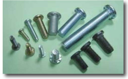
To meet your preferences and needs we offer studs with many different sizes, materials and coatings.

For the complete line of PEM<sup>®</sup> standard self-clinching fasteners and installation equipment, request our catalog or go to www.pemnet.com.