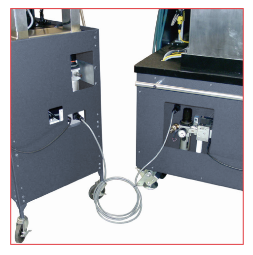
Expand the master system with the addition of an In-die PLUS module to add additional fastener feeding capabilities (example, add a stud to a multiple nut system, or add a nut to a multiple stud system.) Simply connect the fastener delivery tubing to the die and the communication connector to the master system and enter the new configuration into the touch screen control.