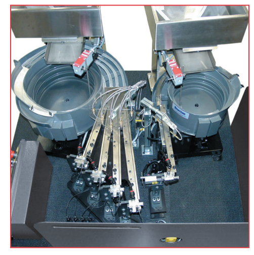
Can be equipped with multiple bowls or multiple configurations at time of order for a one piece system.