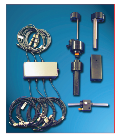
Standard tooling kit.

Standard in-die tooling is available to meet the needs for most applications. Custom designed tooling is also offered to meet the needs of your specific application. Please call us for more information about your requirements. We will be happy to assist you to design the proper tool for your assembly.