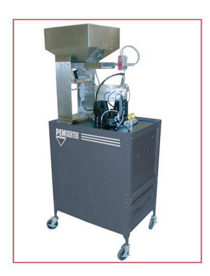
The system has the unique ability to be expanded for future applications. Select the expansion port option at time of order.