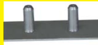
Type TP4 ™ Pins for installation into stainless steel sheets

SEE PAGE 3 FOR MORE FEATURES AND BENEFITS