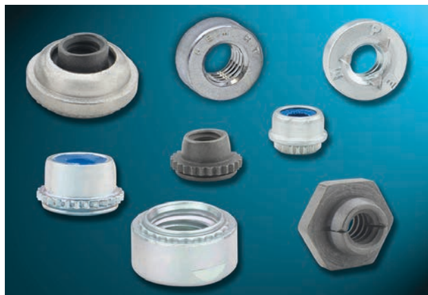
THE ENTIRE FAMILY OF AVAILABLE SELF-CLINCHING LOCKNUTS.

All-metal types “self-lock” the threads of mating hardware by fundamentally altering the shape of the nut